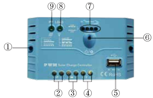
Figure 1 Product Feature